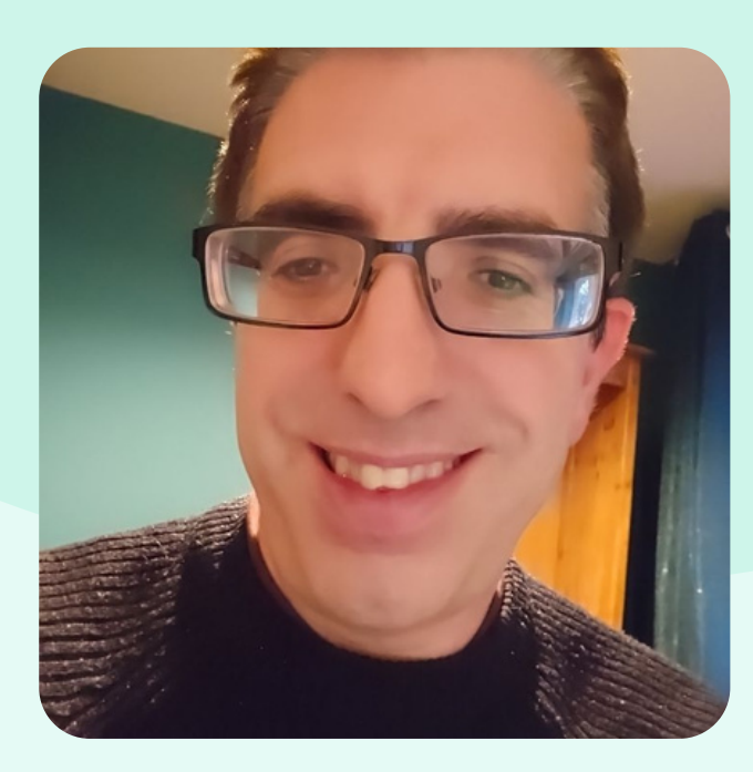
Benefits Team Lead